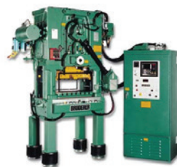
TYPICAL PUNCH PRESS

The inhalation of beryllium-containing dust, mist or fume can cause a serious lung condition in some individuals. The degree of hazard varies depending on the form of the product and how the material is processed and handled. You must read the product specific Safety Data Sheet (SDS) for additional environmental, health and safety information before working with any beryllium-containing alloys.